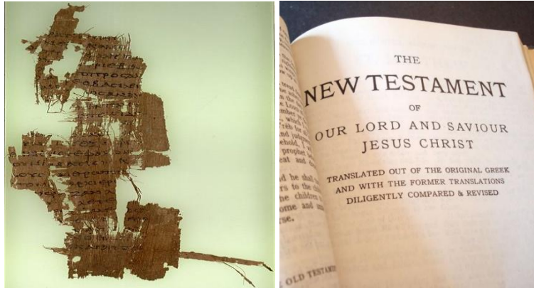
[Left] P90, Gospel of John (18:36-19:7), 2 nd century CE.