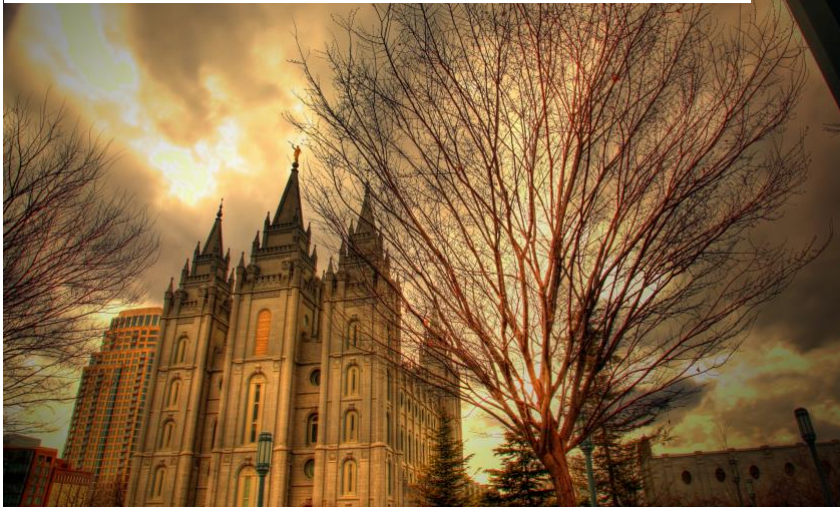
The Church of Jesus Christ of Latter-Day Saints, Temple, Salt Lake City, Utah

WEEK 15 | NEW RELIGIOUS MOVEMENTS (NOVEMBER 28 TH – DECEMBER 2 ND )