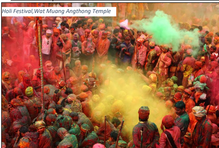
Holi Festival, Wat Muang Anghong Temple