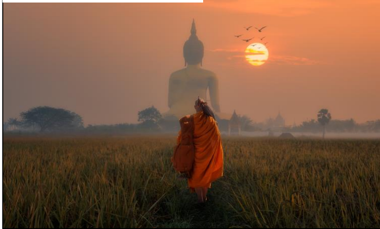
Wat Muang Anghong Temple Thailand.